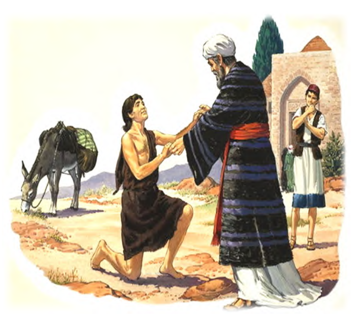
"He was lost and has been found."