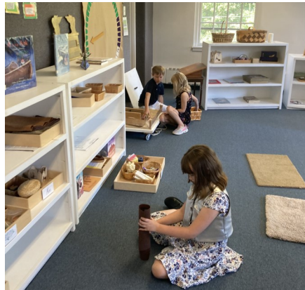
Godly Play class Sunday at 9:30 a.m.