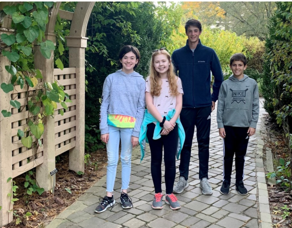
Youth Hike at Nature Realm FA Sieberling (October 13, 2019)