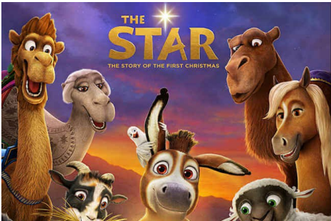
Movie Night “The Star”

Our first pageant rehearsal is at 4:00 p.m. on December 1. Everyone involved with the pageant should attend! Directly following we have a mouthwatering Family Potluck at 5:00 p.m. followed by movie night ...for one and all! The movie ‘The Star’ will be played up in the youth room with a hot chocolate bar and goodies. We will also be putting together Nativity scenes that you can take home.