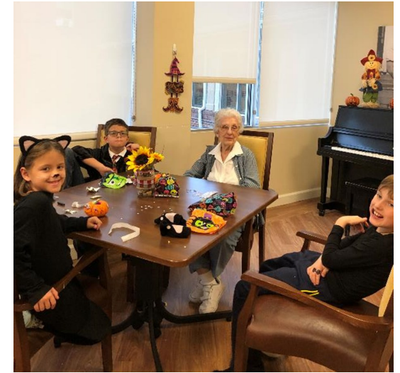
Reverse Halloween Party at Ohio-Living Rockynol.